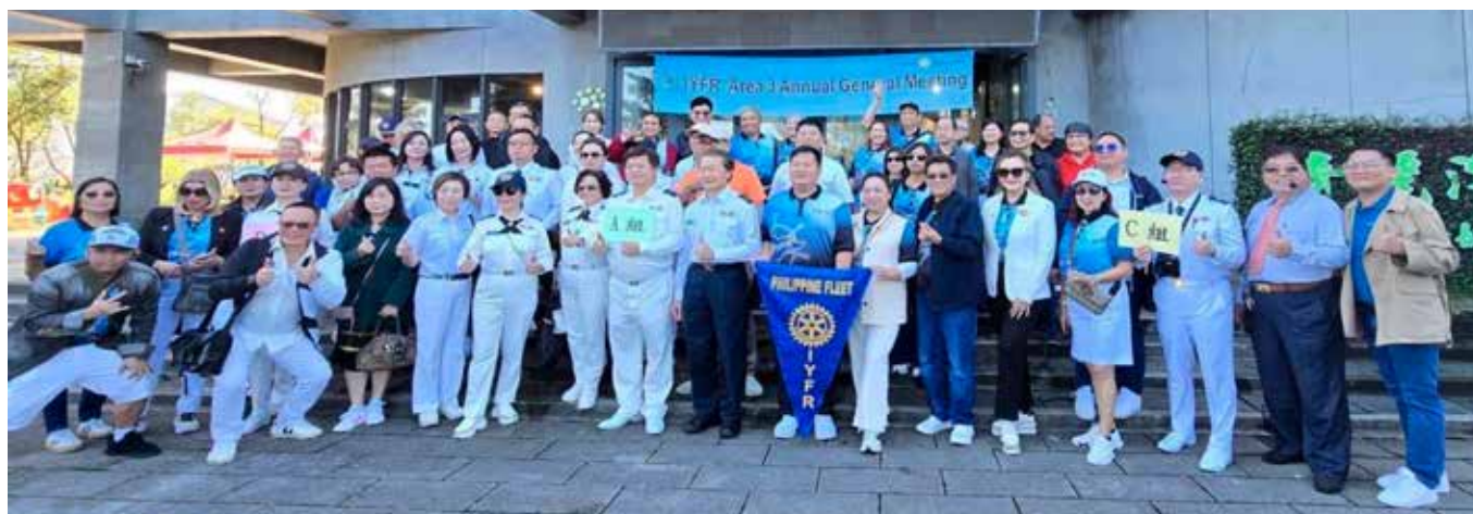
12/1 Visit Light Up Rotary Story Gallery for a Decade for Brilliance.