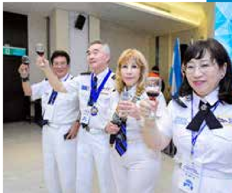
We also had very pleasant music and songs by the new mariners led by DG Healthy.