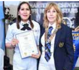
FVC Pinky Mission