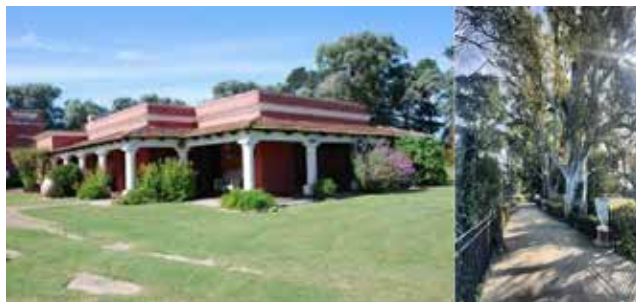
7.00 pm FAREWELL DINNER at Yacht Club Argentino (Puerto Madero)

Country day, at Estancia Santa Susana. Typical Argentine lunch. Show, dances and gaucho skills.