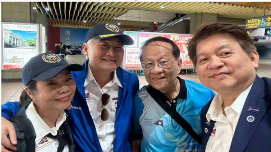
Farewell, we all have FUN FUN FUN