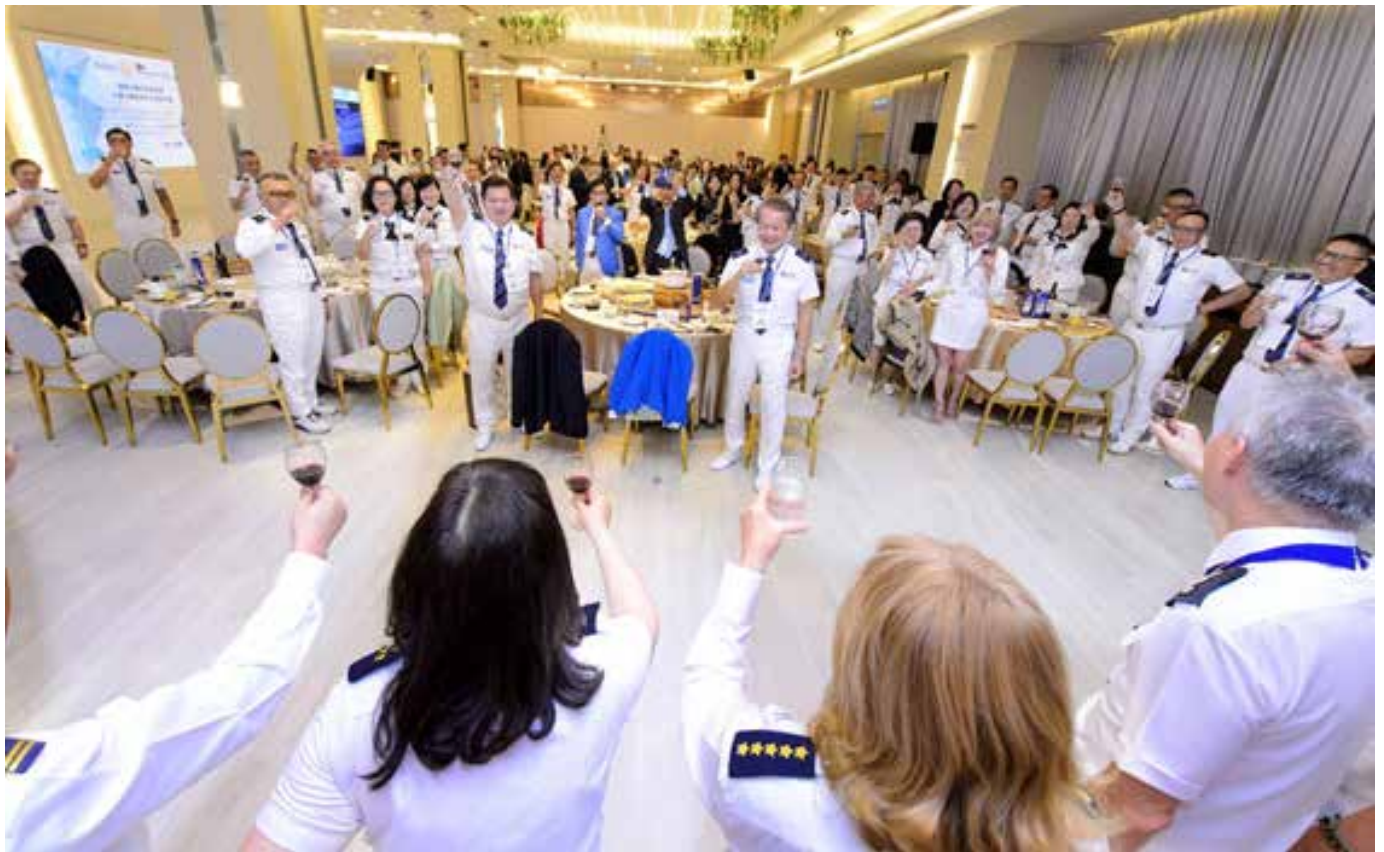
After an exquisite dinner and having listened to inspiring messages given by the illustrious visitors, we took the photos that will remind us of this very special evening. Here we share the images of a FUN FUN FUN night.