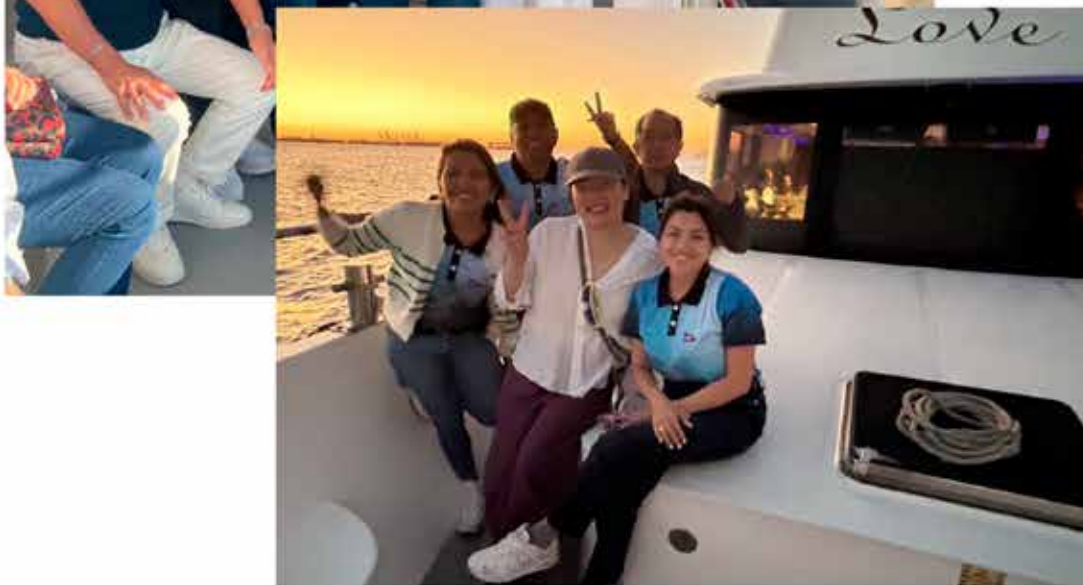
Curse at the Danshui River, enjoy sunset along with friendship.