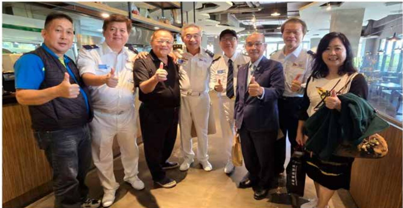
Prepare for Lunch at the Gallery restaurant