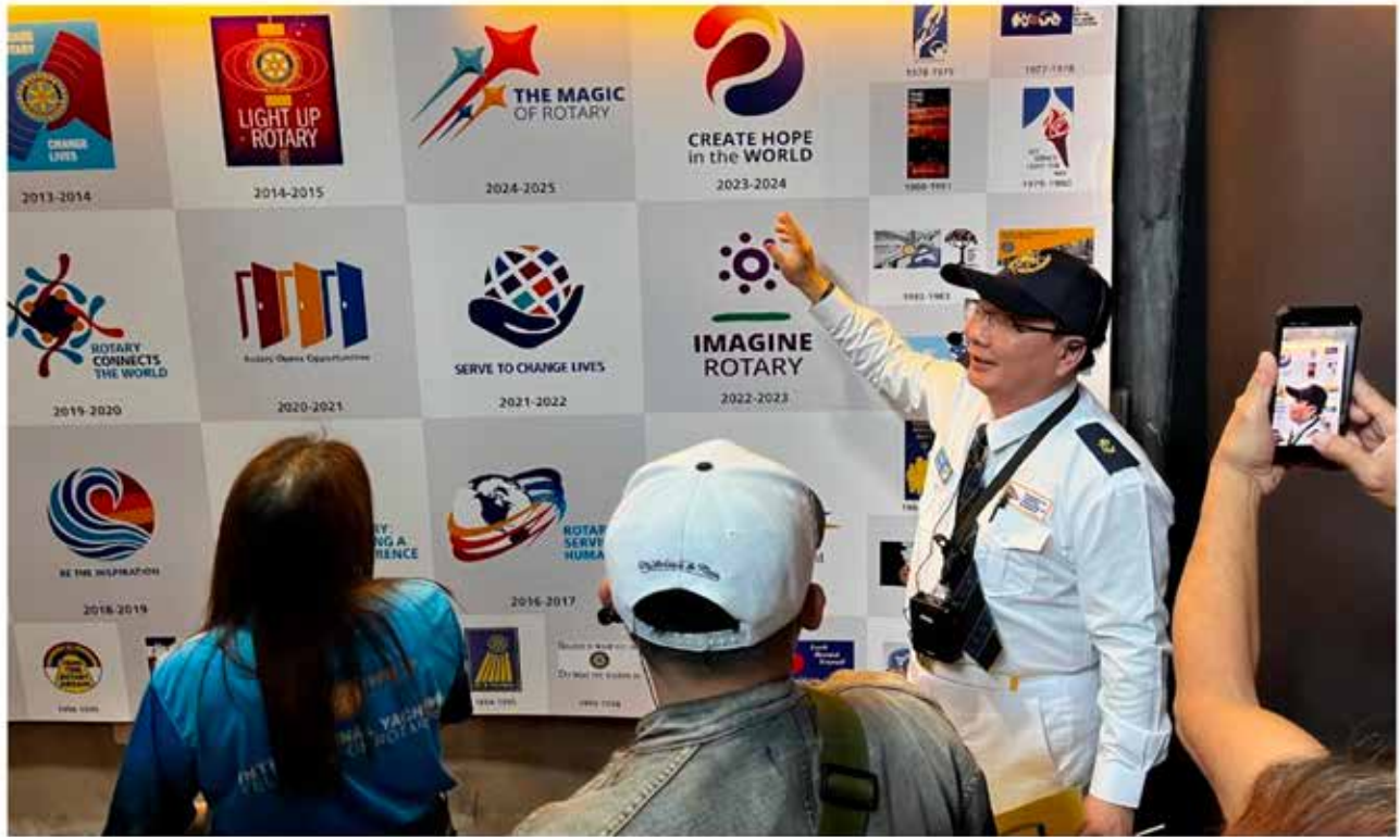
Rotary Year Logo