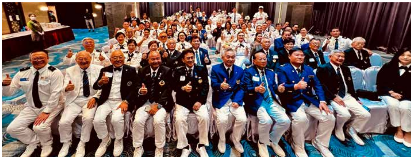
Group Picture after General Meeting December 01, 2024