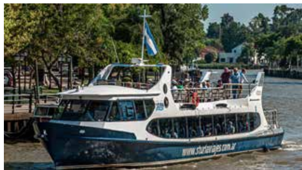
Time for lunch at Vivanco Restaurant

Premium Tigre with lunch. 7.30 am Departure from the hotel to Puerto Madero to board at 8.00 am on a private boat that sails along Rio de la Plata with views of the city of Buenos Aires to the Paraná River Delta. View of the islands, weekend houses, canals, connecting with nature, observing flora and fauna. Rotary service activity at an island school. Then return to Puerto de Tigre.