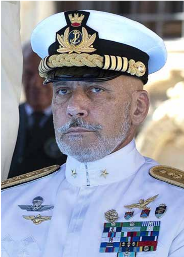
Admiral Giuseppe Cavo Dragone, Pino for Rotarians and IYFORIANS, (Honorary Member of the Italy NW Fleet and RC Novi Ligure D2032) is the leading figure of the Italian Armed Forces, known for his most brilliant career. In January he will assume the role of NATO Military Committee President.