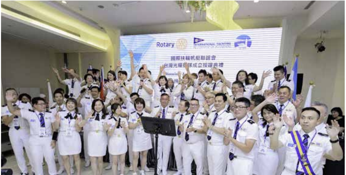
The evening was held in an atmosphere of camaraderie and joy. We toasted the long life of this new fleet and the International Yachting Fellowship of Rotarians.