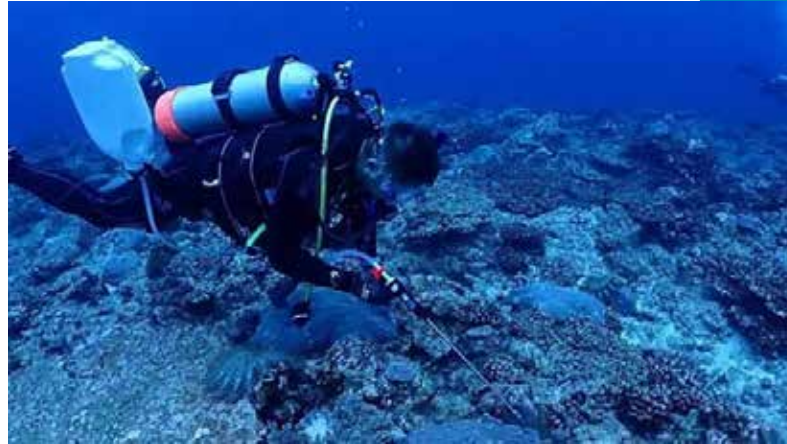
In recent years, the coral ecology has been threatened, and marine resources have become more and more depleted.