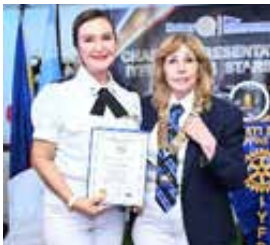
FC Mildred Vitangcol