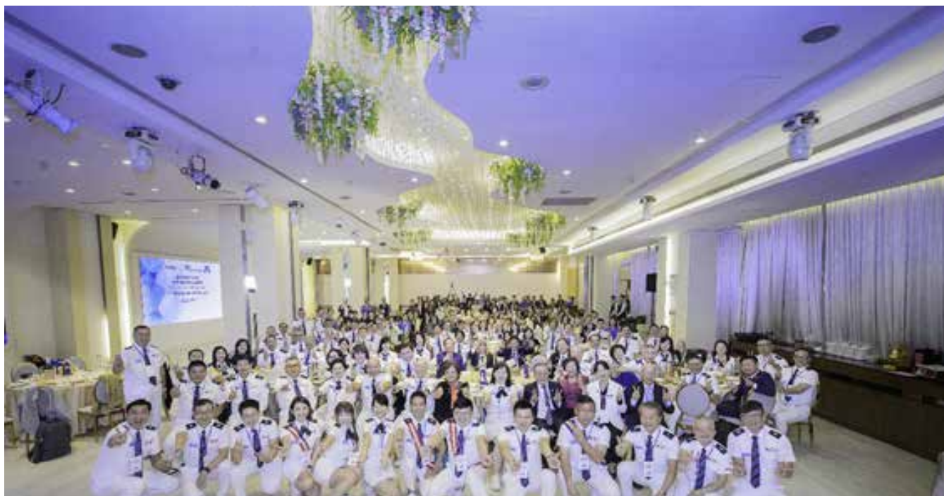
The chartering of the new Taiwan Light Up fleet took place in Taipei on November 8. This new fleet began its journey with 48 mariners.