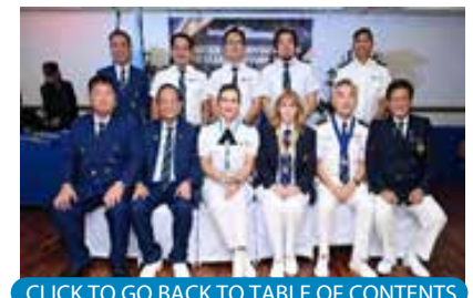
Officers of the various fleets in the Philippines were guests of the event.